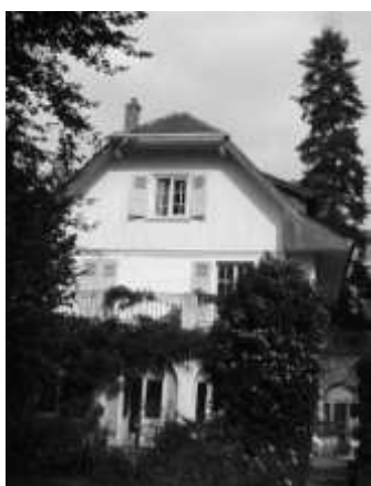
Quaker House, Geneva