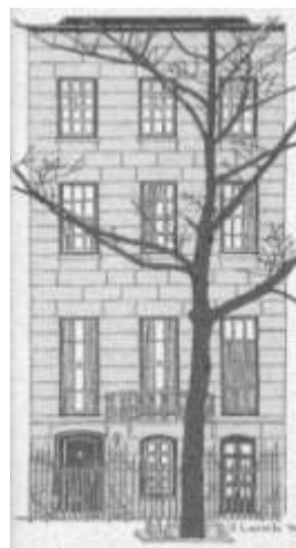
Quaker House, NY

Friends were involved with the UN from the start. The two major centres of the UN are New York and Geneva, and Quaker offices were established in these centres around the same time as the UN